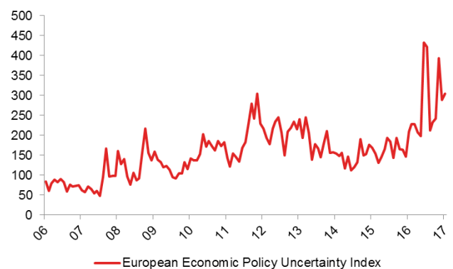
Figure 3: Uncertain times in Europe

For now the Trump reflation trade, higher growth, a pickup in inflation and moderate policy tightening by the Fed, dominate markets and we expect equities to continue to outperform bonds through 2017. However, markets have moved a long way from the trough of early 2016, and especially post the US election. This leaves them vulnerable to a correction both on a valuation basis and as a result of the inevitable political and policy risks faced globally. In particular, the unpredictability of Trump heightens uncertainty and the period of subdued volatility we have enjoyed over the past few months will surely be tested before too long.