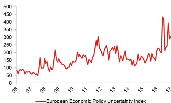
Figure 3: Uncertain times in Europe

For now the Trump reflation trade, higher growth, a pickup in inflation and moderate policy tightening by the Fed, dominate markets and we expect equities to continue to outperform bonds through 2017. However, markets have moved a long way from the trough of early 2016, and especially post the US election. This leaves them vulnerable to a correction both on a valuation basis and as a result of the inevitable political and policy risks faced globally. In particular, the unpredictability of Trump heightens uncertainty and the period of subdued volatility we have enjoyed over the past few months will surely be tested before too long.