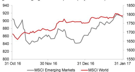
Figure 1: Emerging market equities play catch-up

Predictably, the period was dominated by Trump's inauguration and first policy moves. All the evidence demonstrates that he is a man in a hurry, and fully intent on implementing his key campaign messages; the early executive orders signed and measures intended to be introduced included pulling the US out of the Trans-Pacific Partnership trade deal, possible border tax on imports, a Federal hiring freeze, ban on travel from certain countries, deregulation of certain