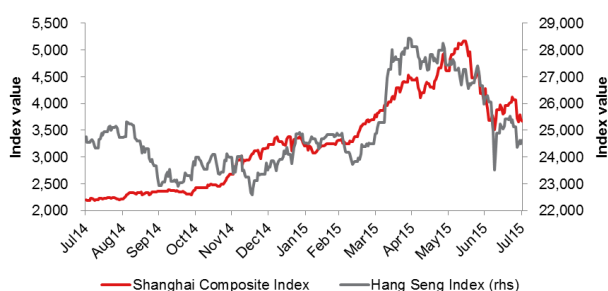
Figure 1: China and Hong Kong equities

While few foreign investors have direct exposure to China's domestic stock market, there have been knock-on effects in Hong Kong and in Chinese stocks listed in New York and elsewhere. Events in China are also at risk of hitting those companies in developed markets with significant exposure to the Chinese market. There have been a series of warnings from car producers, suppliers of capital goods, luxury goods and other consumer products that the Chinese boom has slowed, with potentially damaging consequences for revenues and profits.